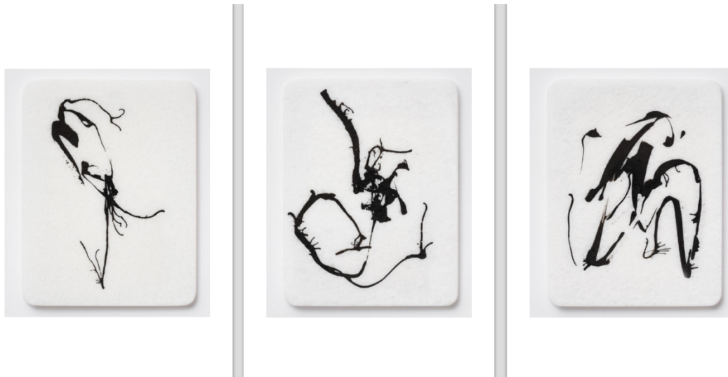
Lee Mingwei, Chaque souffle une danse (Each Breath a Dance) , 2024. Performance installation with sumi ink on alabaster slabs. Each slab 30 x 23 cm.

Escalating global discord and a tumult of emotions prompted artist Lee Mingwei to practice a “regimen of deep, tranquil breathing”, an act that both grounded the artist in the moment and provided the creative inspiration for Chaque souffle une danse (Each Breath a Dance) . Over an extended period, directly following his daily meditation, Mingwei watched the sun setting on the horizon each evening and began creating his “breath drawings.” Taking contemplative breaths and slowly exhaling to move droplets of sumi ink across alabaster slabs, each new artwork “assumed a distinctive essence, an embodiment of the atmospheric conditions and emotional context inherent at the specific moment of creation,” said Lee Mingwei.